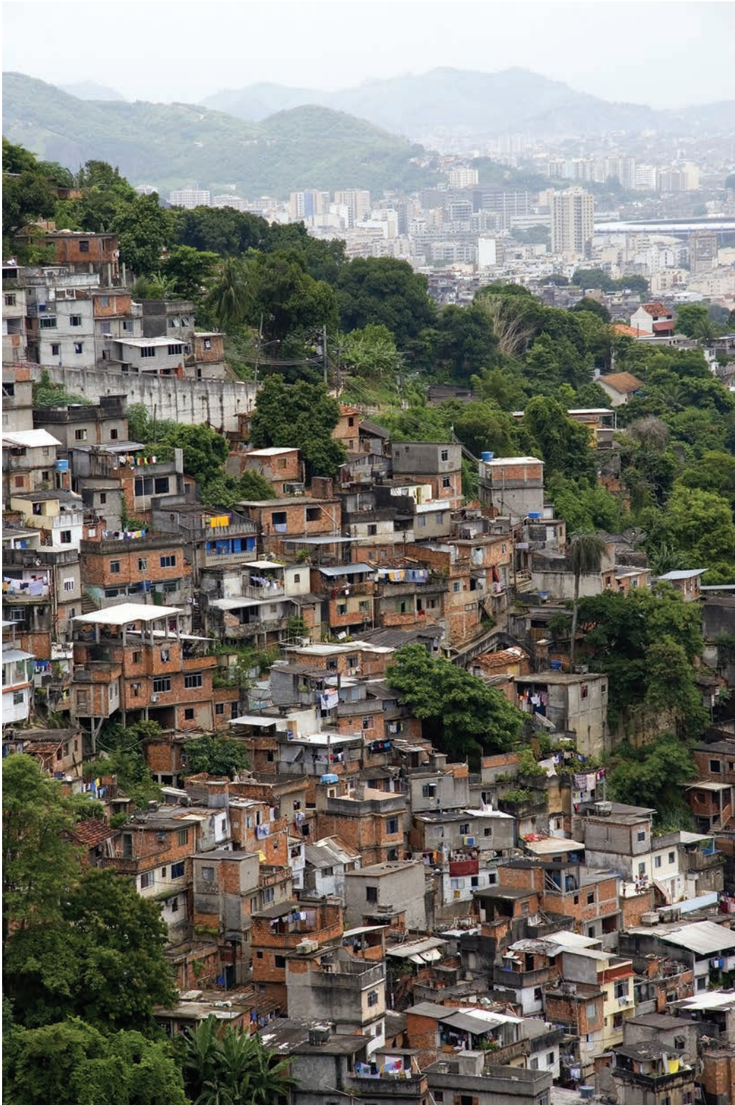
Fig. 6.2 for Question 6(b)