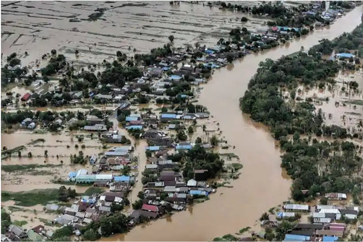
Fig. 3.2 for Question 3(c)