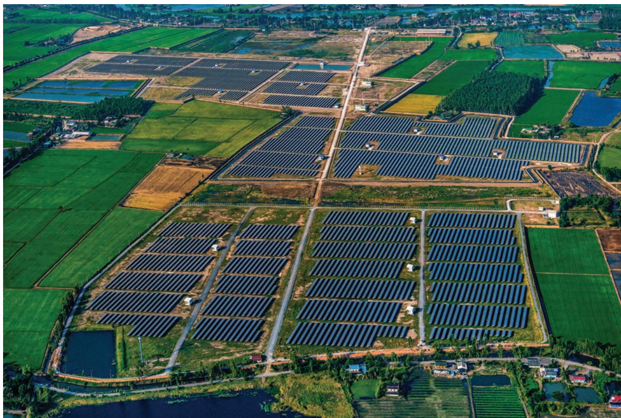
Fig. 4.3 for Question 4(c)